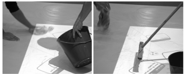
Figure 4 The iFloor – mud and technology go together

Apart from the three cases' ability to cope with dirty computing they relate, as mentioned earlier, differently to the concept of street and plaza which have implications for their social impacts and interaction styles. The three cases will now be discussed in relation to these issues.