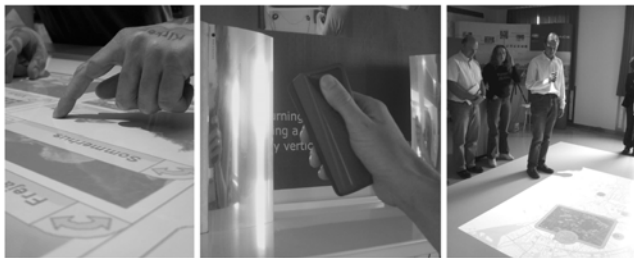
Figure 3 From left to right: close-up of table. Emote, and mediafloor.

MediaSurfaces is a concept allowing people to distribute their digital materials on a range of connected interactive surfaces in the home [7]. These surfaces range from being table projection, wall displays as well as projections on floors. Floor projections are oriented in one direction, e.g. such that the materials are displayed at the entrance and viewed as people come home.