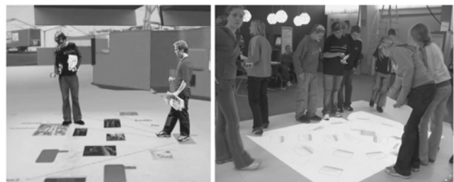
Figure 2 Playful interaction on the left, and iFloor on the right

Playful interaction (See Figure 2, left) is a vision prototype developed as part of the Workspace project [1]. The motive behind the vision was to explore how more playful relations to materials can be established in a work environment. Among other ideas, this video depicts a vision where digital materials can be placed on- and picked up from a floor through bouncing a ball on the floor. Thus the ball is used as means for placing and picking up documents on physical surfaces like floors and walls. Documents are organised in dynamic tree structures, oriented primarily one way. People stand on the surface when interacting with it.