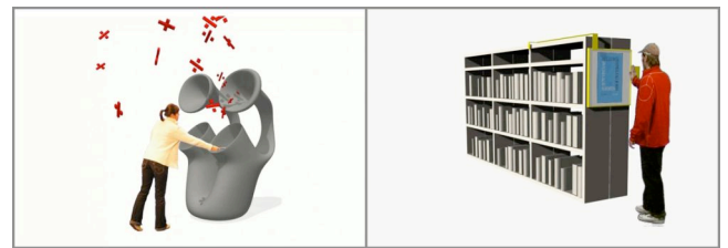
Figure 6. A) Critique Collector. B) Shelf-slider.

Here children return their books in the positive or the negative box, and thereby express opinions about the book. Both input and output are instant, and is connected to an act the children will have to do anyway, namely returning the library material. The idea originated from having children informing other children on what to read. Children are reluctant in doing traditional reviews, as these are time consuming. The installation should provide a swift indicative rating of the borrowed material. See figure 6A.