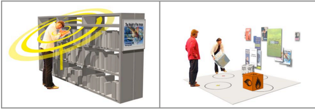
Figure 7. A) Lib-Phone. B) CubeSearch

environment, enabling new forms of play and information exchange. See figure 7A.