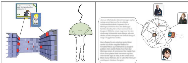
Figure 5. A) The search helmet. B) The moon rock.

This is a type of magic large ball-shaped interactive device revealing the content of a book in an explorative way. When putting a selected book into a slot in the "moon-rock", the book is visualised in a peephole manner on small-sized screens showing: the plot, the bad guy, the hero, the main character, the setting, etc. The children get a glimpse of the story inspiring for exploration, the "rock" thereby being a supplement to the narratives about the book to be found on the back cover of the book. The concept originated from children wanting to have explorative glimpses, get snippets of the story to help judge its attractiveness. See figure 5B.