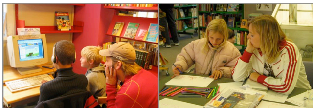
Figure 1. A member of the research team A) studying children playing a computer game, and B) sketching with a child.

We visited in total three different libraries for field studies; one for observational studies only and two where we did engage the children in activities that would help us understand their perceptions of the current library and what they would like to see happen in the near future. There were four steps in the user studies in the two libraries. Firstly we placed ourselves in the children library department, and started to pack up things that we had brought. The children were curious about us, and approached us to ask what we were doing. We asked them to tell us about the library, what they were doing there, why they were there and what people they would meet there, see figure 1A. We asked the children to make short video films about the library, where they would film each other demonstrating and telling about the library, without us interrupting. Secondly in the middle of the room we had a table which we filled with crayons and papers, and we asked the children coming up or passing by to draw from one of two themes, either how the library will look like in 100 years, or to explain how the library is on the planet Mars.